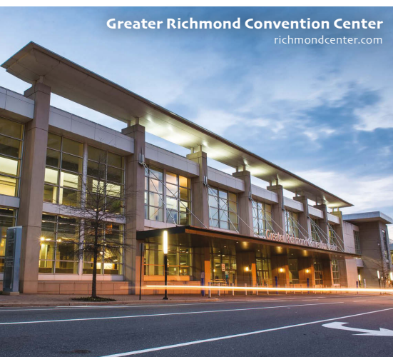
Greater Richmond Convention Center richmondcenter.com

Richmond, site of the forty-third annual NGS Family History Conference, offers an exciting experience for attendees, with many excellent hotels, restaurants, and shops, and several outstanding genealogical research facilities including the Library of Virginia just a few blocks away. The Conference will be held in the Greater Richmond Convention Center, richmondcenter.com , 403 North Third Street, a modern convention center set in the heart of downtown and only ten miles from the Richmond International Airport.