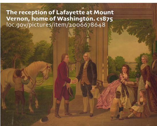
The reception of Lafayette at Mount Vernon, home of Washington. c1875