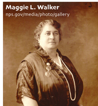
Maggie L. Walker nps.gov/media/photo/gallery

For four years, Richmond was the embattled capital of the Confederacy. Experience a tour of the American Civil War Museum which features exhibits about Union and Confederate soldiers and enslaved and free African Americans. The multi-site museum includes the Historic Tredegar Iron Works and the White House of the Confederacy. Stroll through Hollywood Cemetery, the final resting place of 18,000 Confederate enlisted men, twenty-five Confederate generals, and other famous personages. The tour will also include the Virginia State Capitol and lunch on your own in historic Shockoe Slip, a restored warehouse district with a wide variety of restaurants.