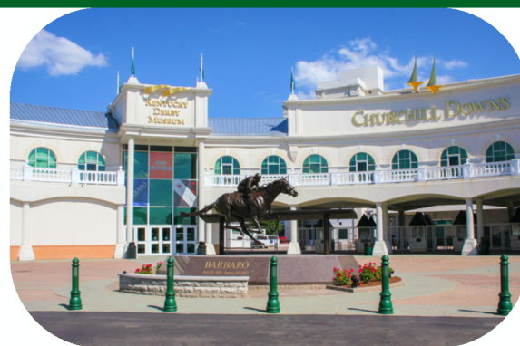
Exhibit Details & Benefits