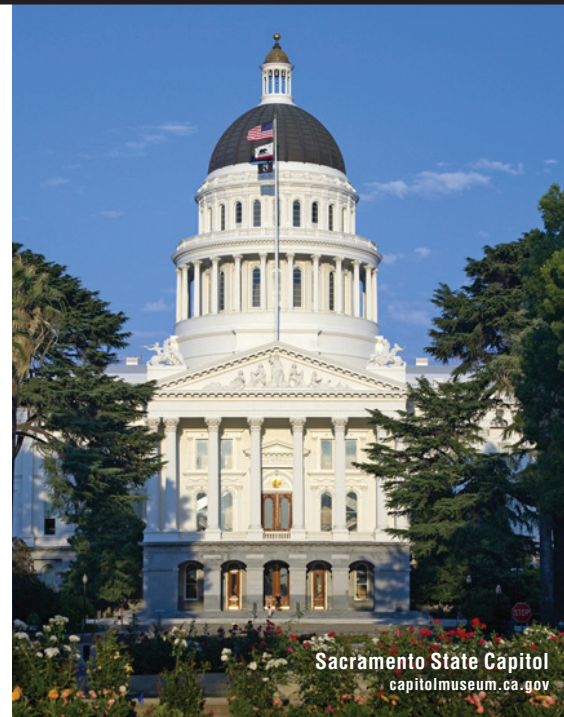
Sacramento State Capitol capitolmuseum.ca.gov

A detailed program brochure including pricing will be available this fall with registration opening in December 2021.